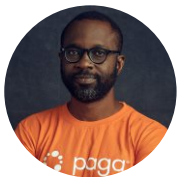
Tayo Oviosu CEO, Paga

African fintechs have become some of the continent's most successful startup categories, but the next frontier is global expansion. This session will discuss what it takes to scale African fintech products into Europe, the Middle East, Asia, and North America. The conversation will also examine why local dominance still matters, how to win trust in foreign markets, and the emerging opportunities in B2B payments, embedded finance, remittances, and digital banking.